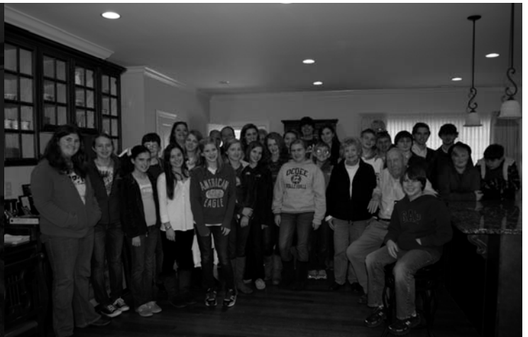
Our youth, gathering for a Christmas party and spreading God's love to our community.