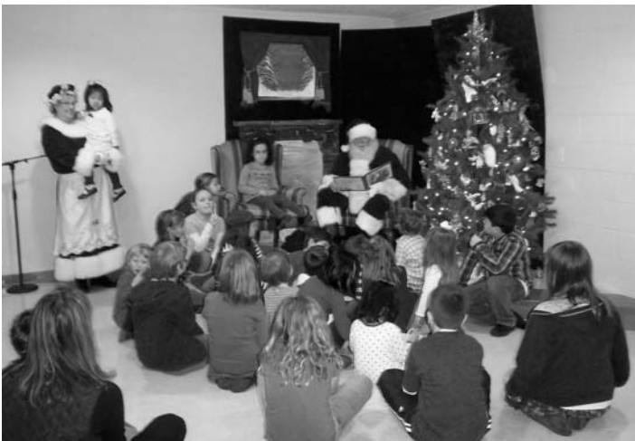
Santa and Mrs. Claus reading the story of Jesus birth at Breakfast with Santa.