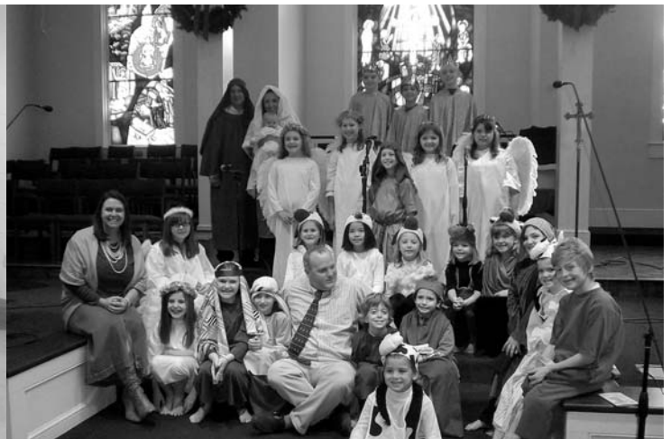
The Joyful Noise Choir and the Good News Puppets presented "A Telling of the Christmas Story."